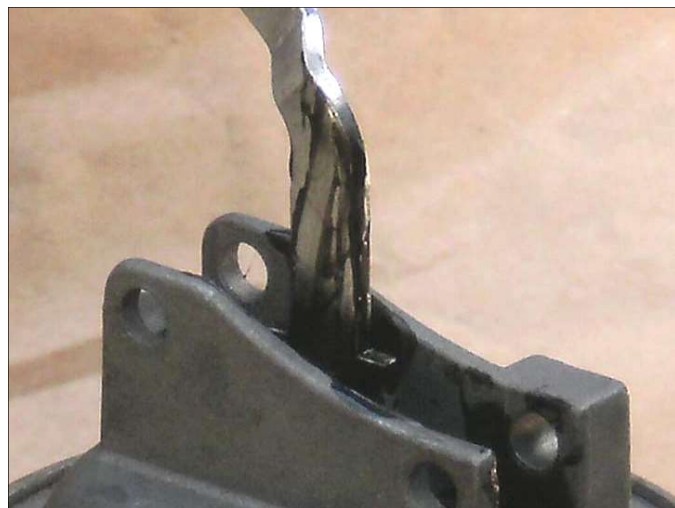
Close up of how sloppy this process can be. No 3.