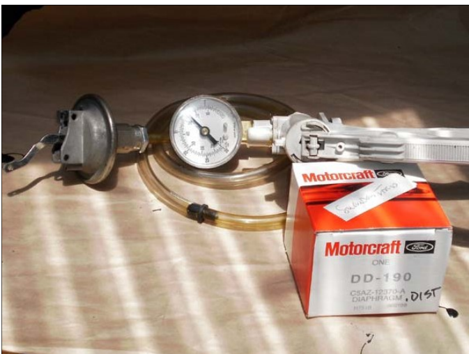
Vacuum testing and maintained on No 3.