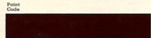
B 50746 ROYAL MAROON

SPECIFY: DDL For DURACRYL® acrylic lacquer • DAR For DELSTAR® acrylic enamel • DQE For DITZCO® alkyd enamel SEE THUNDERBIRD COLORS ON 1968 LINCOLN-CONTINENTAL COLOR CARD