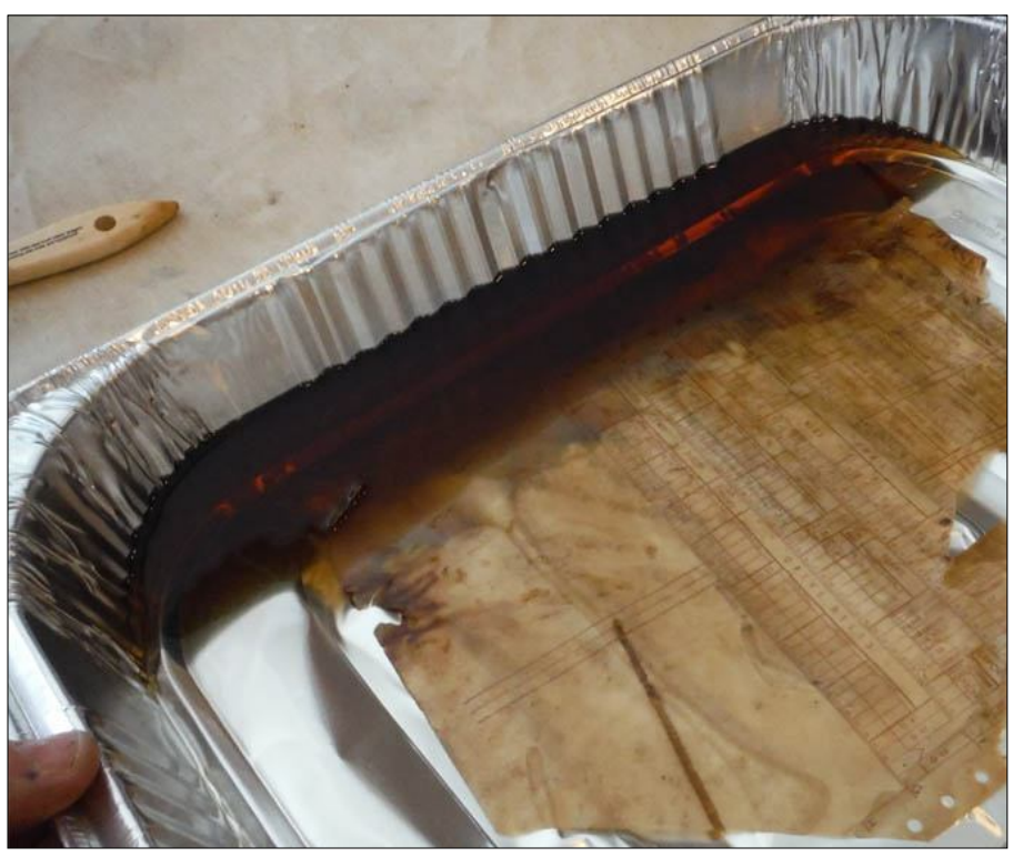
This document, pictures, and descriptions contained within are the property of ConcoursMustang.com 2014. It is attended for private use and may not be transferred, reproduced, or sold by others without written permission. All rights reserved by its creator.

Notice the color of the wax and grease remover after only 2 minutes. Notice the strong amber color removed from the buildsheet and is now suspended in the liquid. Also the lighter shade of paper now. We're just about done.