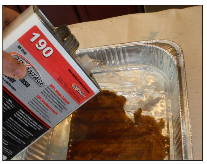
This document, pictures, and descriptions contained within are the property of ConcoursMustang.com 2014. It is attended for private use and may not be transferred, reproduced, or sold by others without written permission. All rights reserved by its creator.

I normally add only enough to cover the paper plus maybe 1/8--1/4 of an inch.