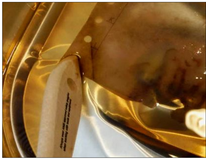
Hold it in place for about 30 seconds so that it starts taking on its original shape. Move carefully and slowly.