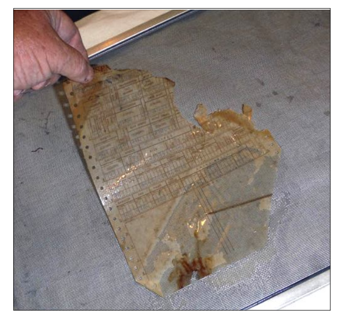
This document, pictures, and descriptions contained within are the property of ConcoursMustang.com 2014. It is attended for private use and may not be transferred, reproduced, or sold by others without written permission. All rights reserved by its creator.

Now remove the buildsheet from the pan carefully and place it on a screen. Using the screen allows the sheet to dry without creating a bond to the material it's drying on. Total time of soaking for this sheet was 3 minutes.